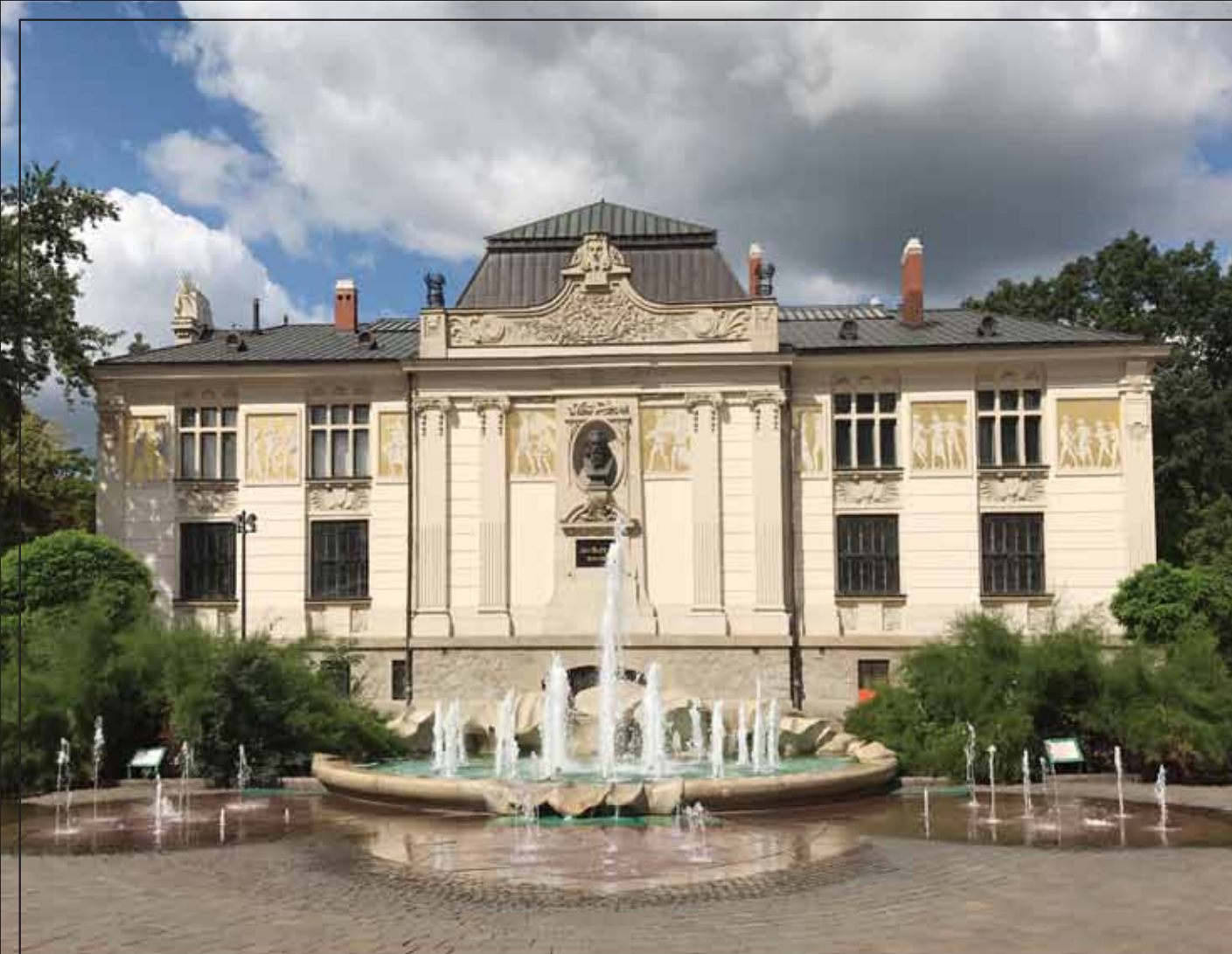
The Palace of Fine Arts in Krakow