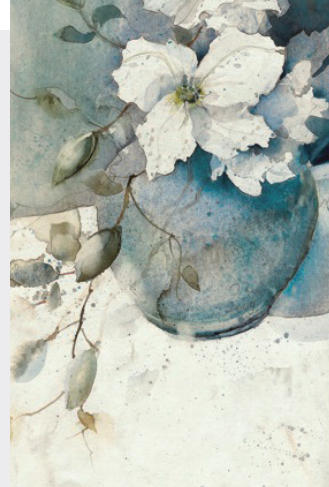
Ingrid Buchthal, Weiße Clematis

Cover picture: Guntram Funk, Ao Sai Daeng art museum Stuttgart